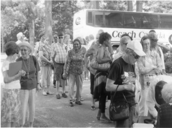
The Bus arriving from Montreal