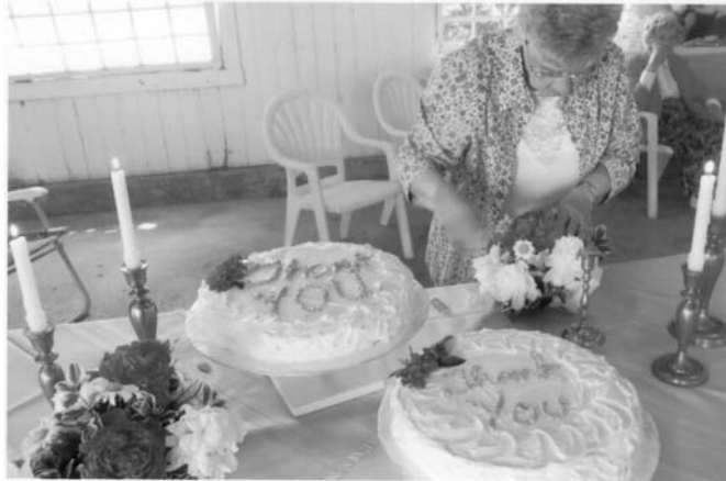
Preparing the buffet table