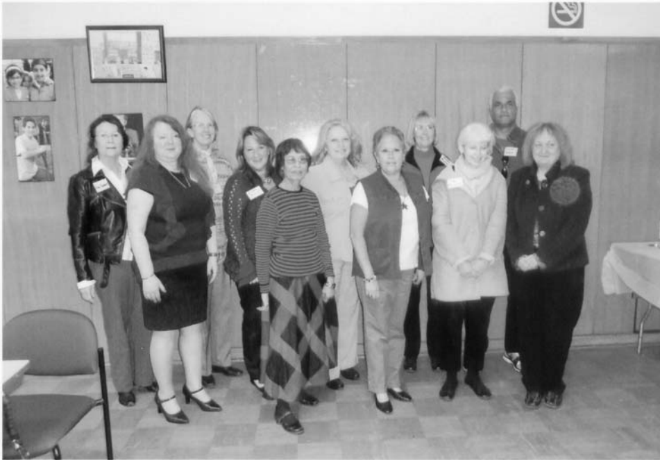
The new members who were in attendance