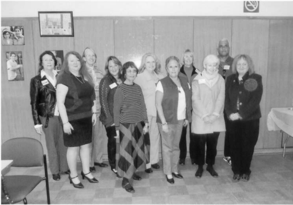
The new members who were in attendance